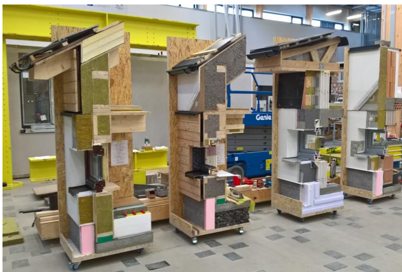
Figure 4. Demonstration models.

This project has received funding from the European Union's Horizon 2020 research and innovation programme